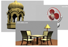
3D Modeling and Animation Works